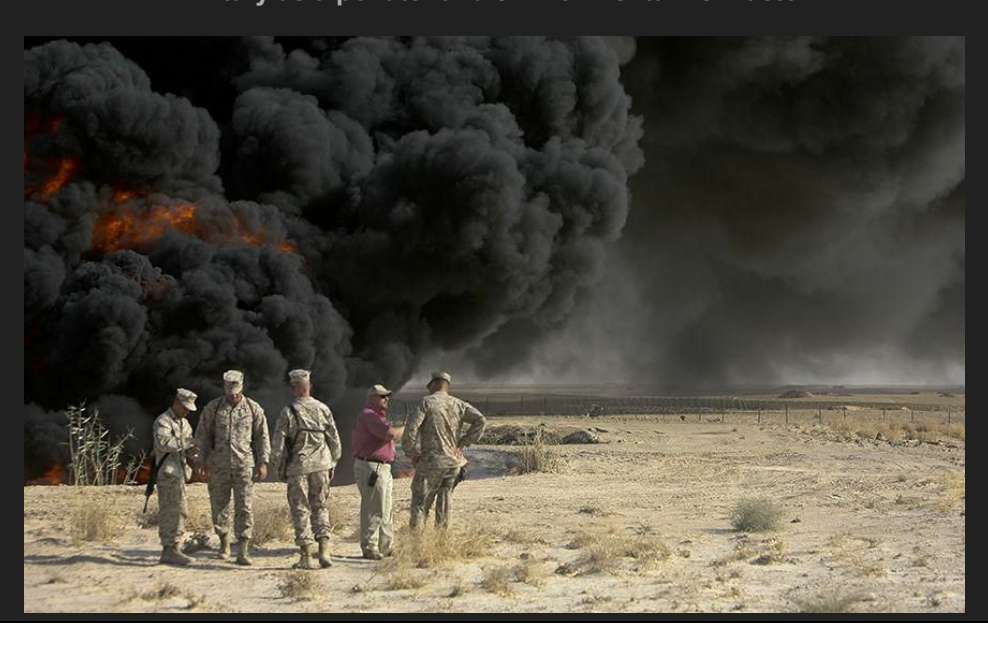
Military as a polluter and environmental risk factor